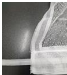
Inserting the plastic rod