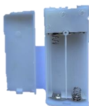
Inserting batteries observing correct polarity