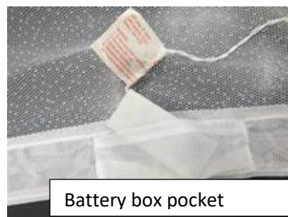
Battery box pocket

ALWAYS USE ALKALINE BATTERIES. DO NOT USE LITHIUM BATTERIES.