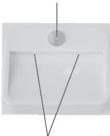
LED lights (4)